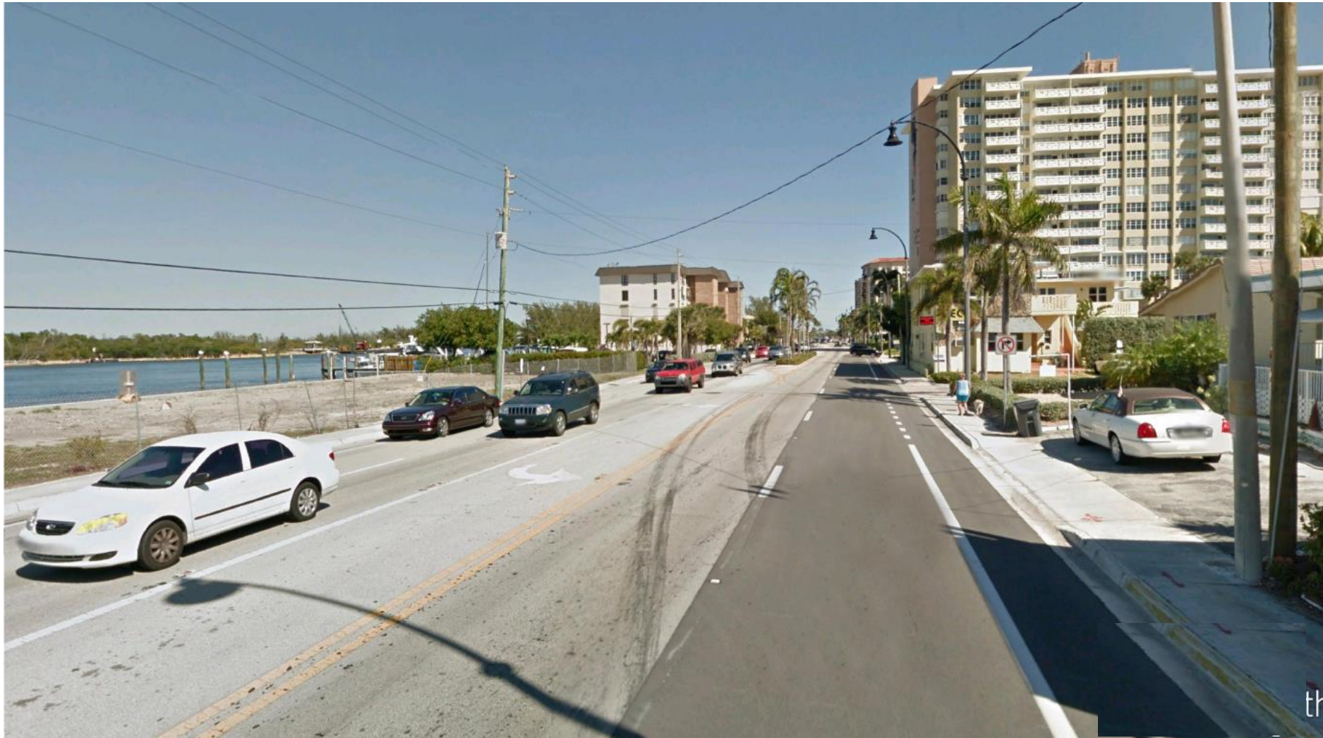
SR A1A as of December 2016 – Looking North